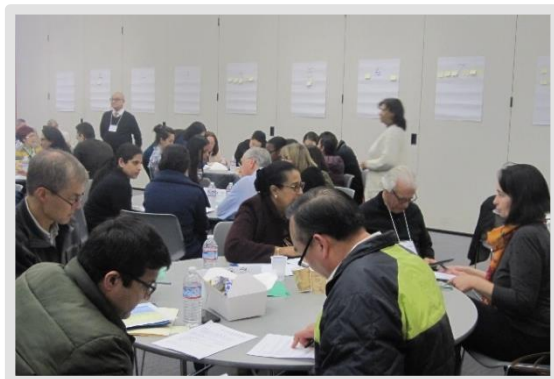
HTHC dental providers at a Continuing Education (CE) course (March 10, 2018)