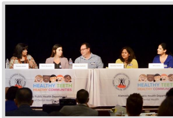
A panel of HTHC CDCCs and dentists at the 1 st Annual HTHC Summit (September 27, 2018)